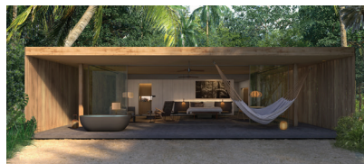
One-Bedroom Beach Villa