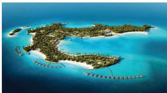
Aerial view of Patina Maldives, Fari Islands

Scheduled to launch in Q2 2021, Patina Maldives, Fari Islands is a radical new example of biophilic design from renowned Brazilian architect Marcio Kogan, founder of international award-winning Studio MK27 . Set in the new Fari Islands archipelago, Patina Maldives is complemented by two other luxury resorts, providing an elevated travel experience.