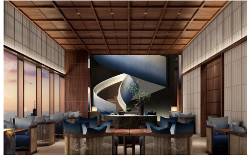
Tea Lounge, paying nod to Japan's tea ceremony culture Guestroom with a view of Osaka Castle