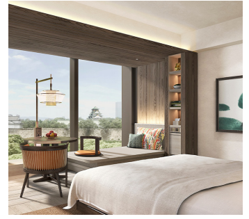
Guestroom with a view of Osaka Castle

Patina's perpetual journey, a seamless flow of energy, is reflected throughout Patina Osaka's design concept. It all begins when guests step foot inside Roots, the signature plant-based restaurant, and are greeted with an inviting warmth from its earthy hues. Guests will explore what is conscious eating through locally-sourced produce with bold and exciting flavours – including ingredients from the edible garden and outdoor nursery.